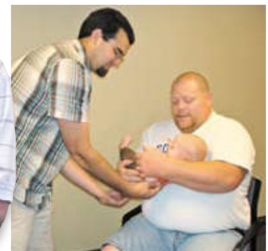
A veteran dad shows a rookie how to hold a baby during a recent Boot Camp class.