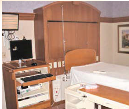
The spacious, private rooms in the EMH Family Birth Center accommodate women through labor, delivery, recovery and postpartum.

Opened in 2002 on none other than Labor Day, the Family Birth Center at EMH Regional Medical Center consists of 18 spacious, homelike rooms and two operating rooms. During the past seven years, the Family Birth Center has delivered more than 8,000 babies. Mothers-to-be and their families are treated to large, private, beautifully appointed rooms — some with over-size bathtubs for hydrotherapy. The suites are designed so that women stay in the same room throughout their birth experience, including labor, delivery, recovery and postpartum. Accommodations for a family member or support person of their choice are available in each room, and new mothers are encouraged to keep their babies with them in their rooms whenever possible. The EMH Family Birth Center has an open visitation policy, which mothers and their doctors will discuss to determine what is right for them.